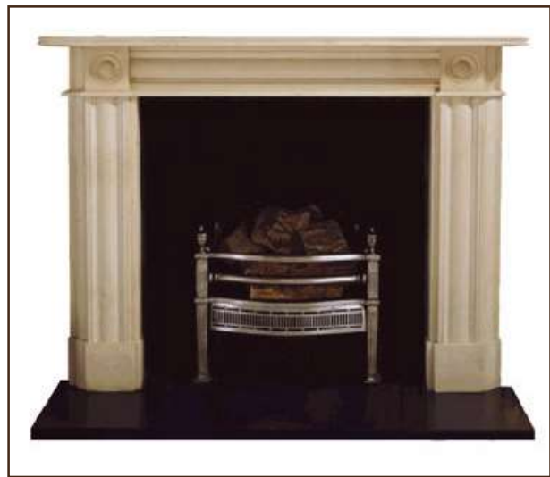
Regency Bullseye Quadrant

Shelf 1473mm x 228mm Overall height 1080mm Width across base 1320mm Internal opening 890mm wide x 915mm high Rebate 63mm