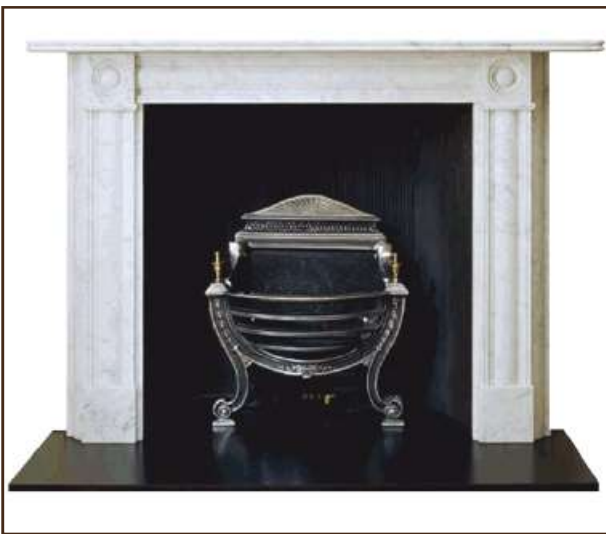
Regency Bullseye Demi

Shelf 1473mm x 228mm Overall height 1123mm Width across base 1318mm Internal opening 890mm wide x 915mm high Rebate 40mm